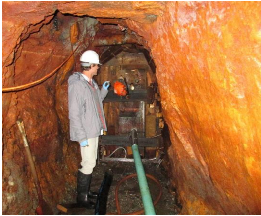
Inspecting the bulkhead shortly after pouring

Other task force members agreed that the consistency of participation was helpful. Beyond that, members highlighted the importance of engaging individuals who approach with cooperative attitudes and are focused on solutions. Graves said, “Sometimes it’s not even agencies — having the right agencies at the table — it’s having the right people at the right agencies that are willing to move forward” and allow others “to take the lead in areas where they have particular expertise.” Peronard added that all the task force participants have been eager and willing to step back, look at the big picture, and be flexible with their needs, and he said these qualities were necessary to finish the project.