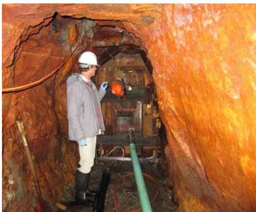
Inspecting the bulkhead shortly after pouring

When the task force's conversation turned to improving the access road to the Pennsylvania Mine, county officials objected because the local community didn't want to draw more recreators and developers to the area and an improved road would be expensive to maintain. The task force was able to find a solution by splitting the cost of improving the access road between the county and the EPA and deciding to improve the road only to the mine and then not maintain it after the project ended. In 2014, the year the first bulkhead was scheduled to be installed at the Pennsylvania Mine, high spring runoff washed away a significant chunk of the access road and a bridge, threatening the project. The county and the EPA partnered to rebuild the road and bridge and kept the cleanup on