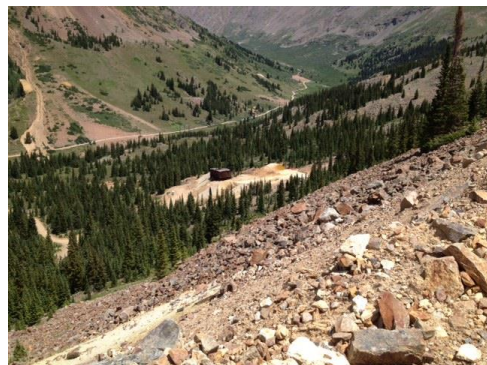
Pennsylvania Mine, Level F Water Management (top), Level F Portal (middle), View of Level F from Level C (bottom)