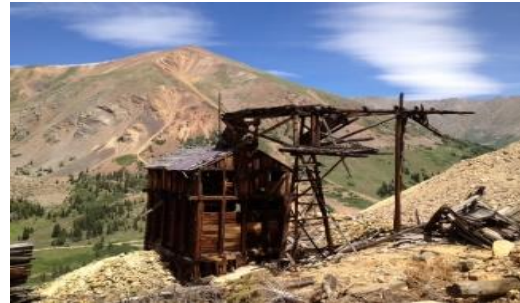
Pennsylvania Mine, Level C Workings

Contaminants include aluminum, cadmium, copper, iron, lead, manganese, and zinc, and exposure to high concentrations of these metals can cause irreversible health problems in aquatic animals. Below the Pennsylvania Mine, Peru Creek is devoid of fish, insects, and other aquatic life, a condition that may be due in part to both mine impacts and background (non-mining) associated metals drainage in the Peru Creek watershed. Farther downstream, the Snake River's lower reaches have life, but it is limited in both diversity and abundance, and the fish there must be stocked.